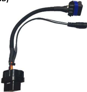
Bench Harness (USB)