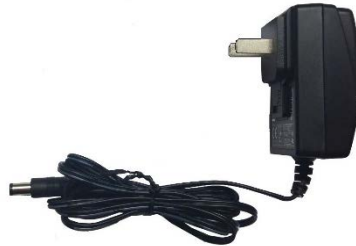
Wall Mounted Power Supply