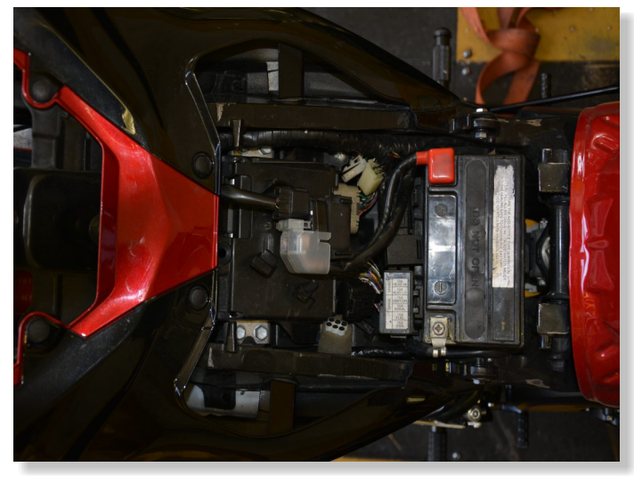
LIFT UP OR REMOVE THE FUEL TANK.

REMOVE THE BLACK COVERS FROM FUEL TANK. REMOVE THE MAIN SEAT.