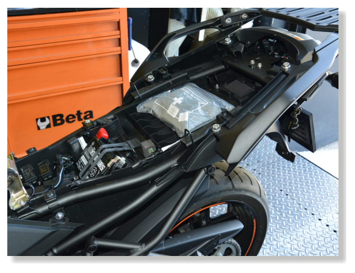
REMOVE THE UPPER SIDE COVERS.