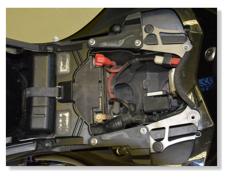
REMOVE THE BLACK FUEL TANK COVERS.