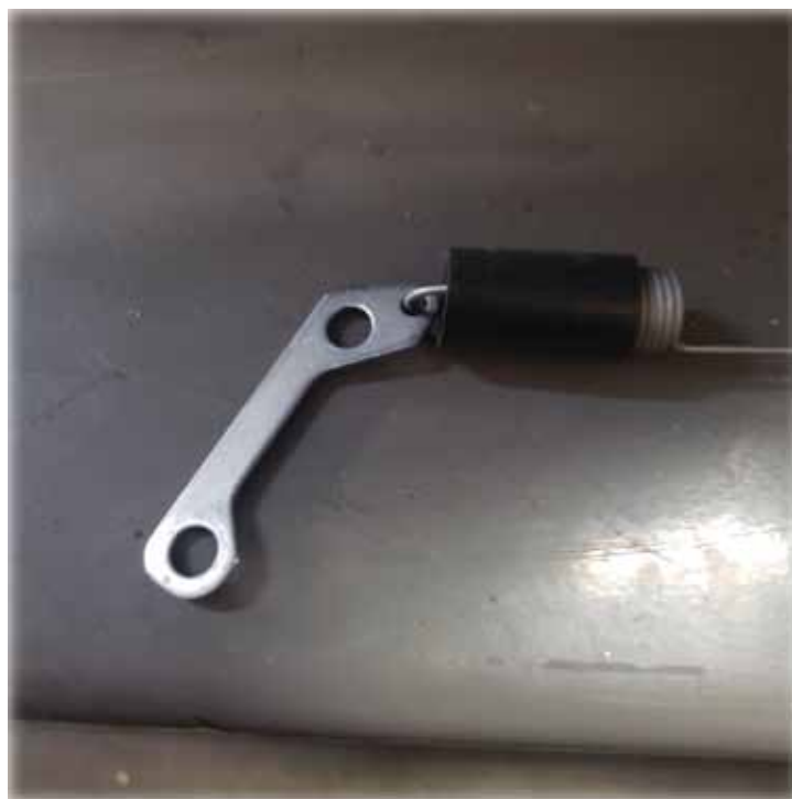
Reuse this part